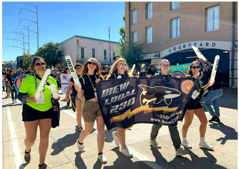
IBEW Local 230 Sisters at Banner Parade, TWBN Conference 2024

I can honestly say, every step of the way, they made me proud and served the entire Local 230 membership in an exemplary fashion. All in all, our sisters learned a great deal and came back pumped to make Local 230 a better union.