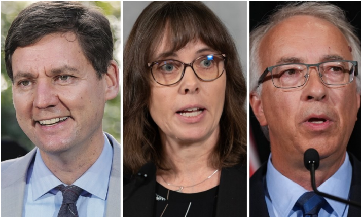
Party Leaders : David Eby, Sonia Furstenu, John Rustad