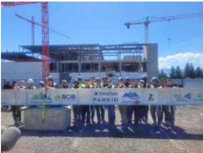
The Last Structural Beam at Cowichan Hospital with the Houle Electric Crew

With the intent to remove all other construction craft unions and their members from these jobs is a direct attack on our