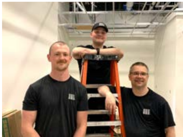
Island Technical Installations at Sidney's Newest Veterinary Clinic

I've been a member of Local 230 for 43 years now and I don't ever recall the Saanich Peninsula as being described as having a "busy construction market," so I googled "building boom in Saanich peninsula" and sure enough, nothing came up, lol. Nothing, I searched more and still nothing, nobody has ever written about the communities on the Saanich Peninsula as having a 'busy construction marketplace' and, it doesn't look like it's ready to slow down just yet as Victoria's International Airport breaks ground on a new Control Tower, the Brentwood Bay Sewer replacement project, and the Province's mandate on increasing urban development for every community in British Columbia to help turn the housing crisis around.