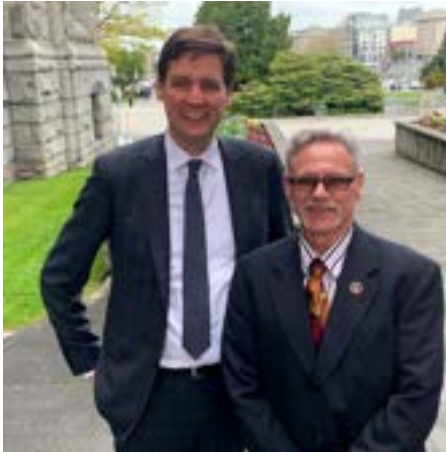
Premier Eby with Business Manager Venoit

In January 2001, I wrote to the Minister of Labour in BC to say that it was time to bring flush toilets to construction workers, after hearing the conditions on the Royal Jubilee project. “At times, the portable johns have been left in putrid neglect, often overflowing. Some workers are bringing in their own toilet paper from home...” a few short months later the BC Liberals became government, and, well, the first few years we went into defensive mode as it seemed like we were reeling from a barrage of collective agreement cuts and attacks on our labour monthly. Then, in March 2020 came along with COVID-19 and Dr. Bonnie Henry telling us we had to wash our hands to stay safe, while our construction members were deemed essential service workers.