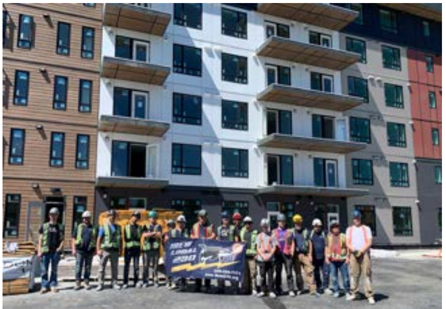
Arm Electric Crew at Condo Project at the Old Marigold Nursery Property

I've been a member of Local 230 for 43 years now and I don't ever recall the Saanich Peninsula as being described as having a "busy construction market," so I googled "building boom in Saanich peninsula" and sure enough, nothing came up, lol. Nothing, I searched more and still nothing, nobody has ever written about the communities on the Saanich Peninsula as having a 'busy construction marketplace' and, it doesn't look like it's ready to slow down just yet as Victoria's International Airport breaks ground on a new Control Tower, the Brentwood Bay Sewer replacement project, and the Province's mandate on increasing urban development for every community in British Columbia to help turn the housing crisis around.