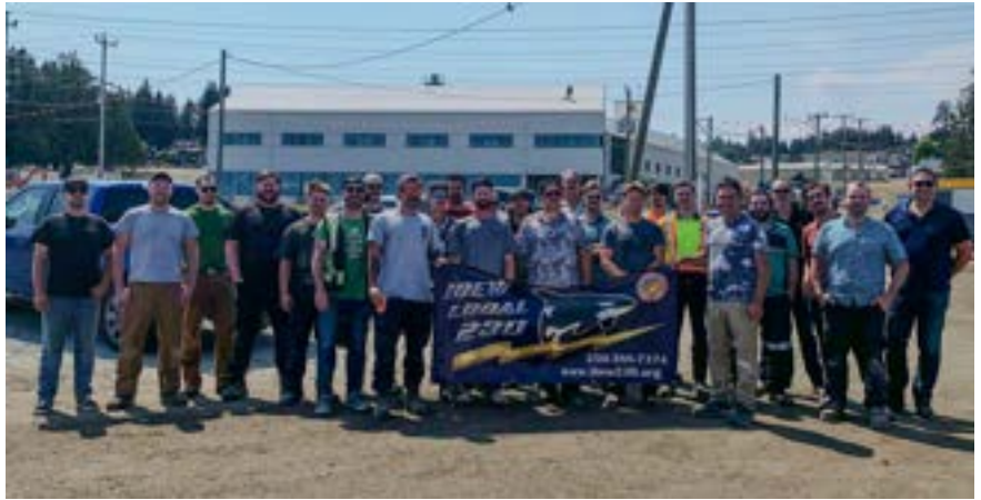
Sasco Contractors Breaking Bad at the Government's Newest Cook House