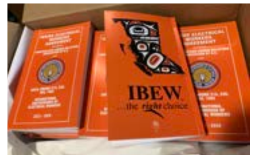
2023-2026 IBEW Construction Collective Agreement

I would like to finally draw your attention to page 139, where you will find a list of our Counselling Services and contact information, so our members do not have to run the gauntlet of calling the local union staff to get this information to help them when they and/or their family need help.