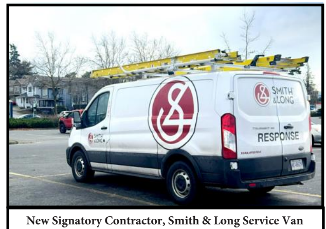
New Signatory Contractor, Smith & Long Service Van