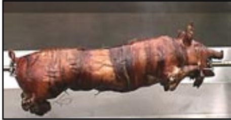
At least one guest ends up in this position, at the annual event.

This years IBEW / Baskin Pig Roast was one of the biggest and best to date, with all the family favorites; the giant clown head air jump for the kids,