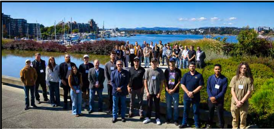
Local 230 Youth Members, Staff, and IBEW Representatives at NextGen

In late September, we held our third triennial Local 230 Youth Conference. We brought in almost fifty Local 230 youth members from all over Vancouver Island to participate in two solid days of education and networking with peers.