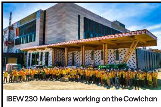
IBEW 230 Members working on the Cowichan

The new Cowichan District Hospital (CDH) is being built on the unceded traditional territory of Quw'ustun (Cowichan) People. This seven-story tower, 200-bed facility will be over three times larger than its replacement in Duncan, and 800 free parking spaces. With the use of BC's mass timber and glass bringing in plenty of natural light will provide a great connection to its natural surroundings, overlooking the Valley. Something for IBEW members to be proud of is, this is the first fully electric hospital in BC reducing its carbon footprint in our community and province.