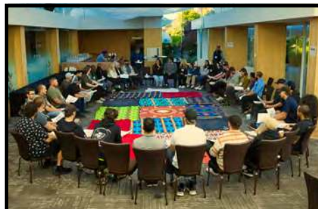
KAIROS Blanket Exercise is an experiential teaching tool that explores the historic and contemporary relationship between Indigenous and non-Indigenous peoples in the land we call Canada

In late September, we held our third triennial Local 230 Youth Conference. We brought in almost fifty Local 230 youth members from all over Vancouver Island to participate in two solid days of education and networking with peers.