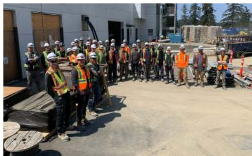
Members at the Nanaimo Correctional Centre

Emery Electric – The Salt Spring Island Rainbow Recreation Centre – Electrical Upgrades including, replacement of existing main service, distribution panels, transformers, and motor control centre. Pender Island Magic Lake Estates – Upgrades to and new construction, and equipment installation and commissioning of the Wastewater Treatment Facility, Cannon Pump Station, Schooner Pump Station, and Galeon Pump Station, and the City of Victoria's Chatham Sewage Lift Station Upgrade.