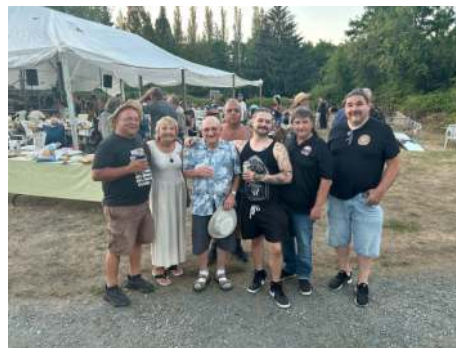
The Baskin and IBEW Local 230 Annual Pig Roast