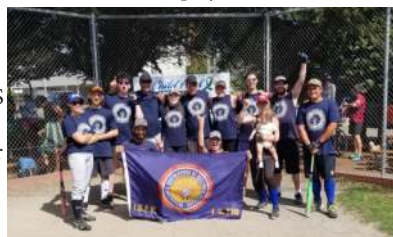
Local 230 Live Wires Slo-Pitch Team

Formerly the FMF STARS the Bolts have been playing for 5 years now.