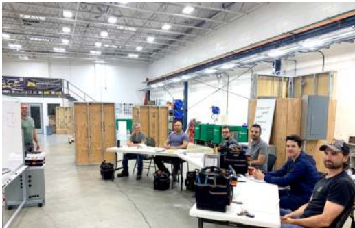
Shop Space at the New Training Centre

Nanaimo Unit 2 September 21st 7:00 PM 306-477 Wallace Street