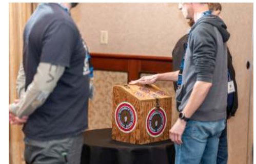
Youth Members putting in their ballots for NextGen Chair, Vice-Chair and Recording Secretary

Please spread the word to other local 230 youth so we continue on the success of this important event come 2025!