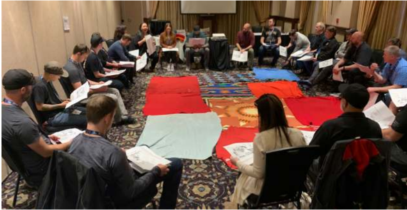
Stewards participating in a Blanket Exercise facilitated by Kairos Canada