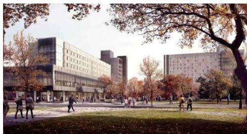
Rendering of the project.

Local 230 members are contributing their knowledge and hard work on projects like this today, to build a green and sustainable future for the students of tomorrow. All at the same time creating a chilling effect on rising rental stock in the greater Victoria area.