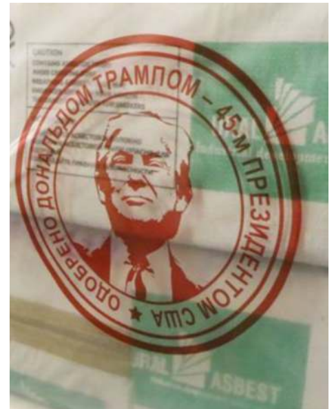
Russian asbestos mining company, Uralasbest, puts Trump's face on the side of their packaging. The photo is from a Facebook post. Only Russia would tout Trump's lies of asbestos being 100% safe.

For example, WorksafeBC had fined the owners of Seattle Environmental Consulting Ltd. and several other companies owned by the same persons 237 times over a period from 2009-2012 for exposing their workers at least 51 times to the material during renovation or demolition, totaling over $500,000 in fines. That is why the BC provincial government recently introduced Bill 5 - 2022: Workers Compensation Amendment Act, 2022, which proposes new protections to help keep workers safe from the danger of asbestos. The proposed amendments include the establishment of requirements that asbestos abatement contractors must be licensed to operate in British Columbia, and that workers and employers who perform this work must complete mandatory safety training and certification. The bill is currently being considered by the BC Legislative Assembly. Upon passage of the bill, WorkSafeBC will implement the new requirements, which would include, developing the standards that asbestos safety training and certification programs must comply with, and developing a licensing regimen for abatement contractors. While other provinces have taken steps to improve the safe handling of asbestos, B.C. will be the first jurisdiction in Canada to implement a licensing requirement. In 2021, asbestos exposure was a contributing factor in 53 of 161 workplace deaths.