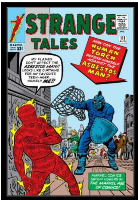
Asbestos even made it into pop culture!

We presented our views recently to the Labour Minister which can be read on our Local 230 website and applaud the BC NDP for moving this file in the right direction, but we also know we need to continue to push this file further to help ensure we have the best protections possible for our members and all who work in our industries. The IBEW in BC has been actively advocating on behalf of our membership for decades to make many of these changes, like requiring all federal, provincial, and municipal public buildings be audited to determine if and where they have asbestos located in their buildings, so they can be responsibly and methodically abated, as well as requiring all construction and shipyard apprentices take asbestos awareness training throughout their apprenticeship, and lastly, designating the last week of April as Asbestos Awareness Week to coincide with April 28th, the Day of Mourning. The day that over 100 countries around the world gather to pay respects for those who lost their lives at work, and commit to making work a safer place for those who continue on. Our work carries on.