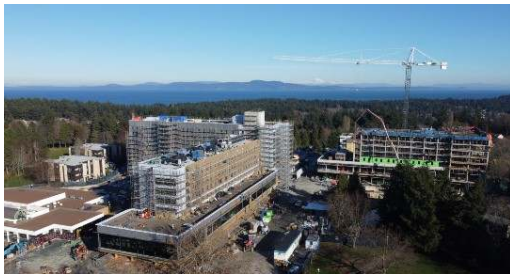
Drone shot of the Dining and Dorms project at UVIC photo from January 2022, off UVIC's website

In early 2017 we sat down to draft the IBEW-BC Provincial Council's Affordable Housing White Paper (located on the 230 website) to provide to the new minority BC government. That broad document provided solutions to the problems our members and communities around BC had been struggling with for well-over a decade from the lack of action by our previous "free-market" radicals, the BC Liberal-Conservative Government. Our document was picked up by the new minority NDP/Green government immediately, and within months they were employing portions of the IBEW's White Paper. One of those solutions was, our position on Colleges and Universities around BC and their addiction to international students to help them with their budgetary needs. Our document explained how attracting international students without providing any dormitories artificially raised the cost of rental stock in the surrounding areas, making rental affordability a problem for domestic youth, and those who could not afford to purchase housing. The new government met with colleges and universities around BC to offer low-interest long-term loans to these institutions, to utilize in building necessary dormitories, and I'm incredibly pleased this initial strategy document work has translated into on-the-job-work for about 75 Local 230 members for a year.