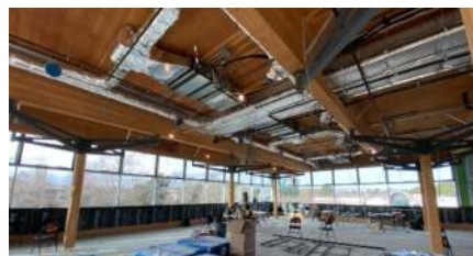
New Dining Hall in Building 1.