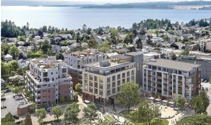
Esquimalt Town Square Construction Moving Forward Aragon Properties Ltd. | (PC: Western Investor)

Esquimalt has a long history that dates back to the First Nations people approximately 4000 years before European Settlement in the late 1700s. The original town has disappeared within the Canadian Forces Base and little of the village heritage remains. Today, the township is characterized by its proximity to downtown and its mix of commercial, residential and industrial development. The area is home to some of the largest employers on the South Island such as CFB Dockyards and Seaspans Victoria Shipyards, which together employ approximately 400 Local 230 members.