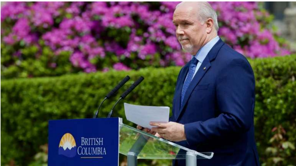
Premier John Horgan pictured on June 11, 2020 speaking about COVID-19.

With the BC General Election fast-approaching, I would like to remind you that it is your right and civic duty to vote. We often forget that there was a time in Canadian history when not all individuals were allowed to vote. Voting is a way for your voice to be heard and you'd be mistaken if you didn't think your vote is meaningful! I realize that politics and elections can be convoluted and overwhelming, especially with an influx of information available from social media, the news and people around us. For that reason, I'd like to take the opportunity to shed some light on the two parties that will most likely form the next majority government, the incumbent New Democratic Party (NDP) or the BC Liberals.