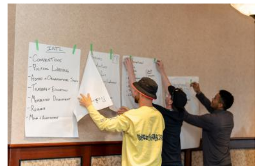
Youth Members at Labour History Course