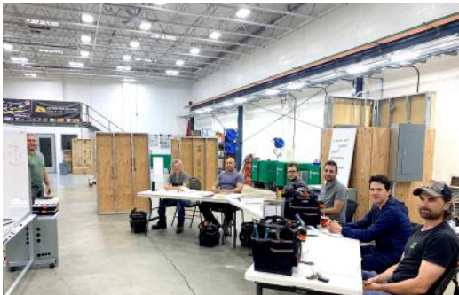
Shop Space at the New Training Centre

Nanaimo Unit 2 September 21st 7:00 PM 306-477 Wallace Street