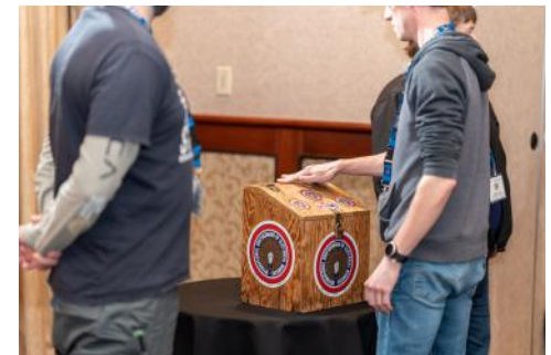
Youth Members putting in their ballots for NextGen Chair, Vice-Chair and Recording Secretary

Please spread the word to other local 230 youth so we continue on the success of this important event come 2025!