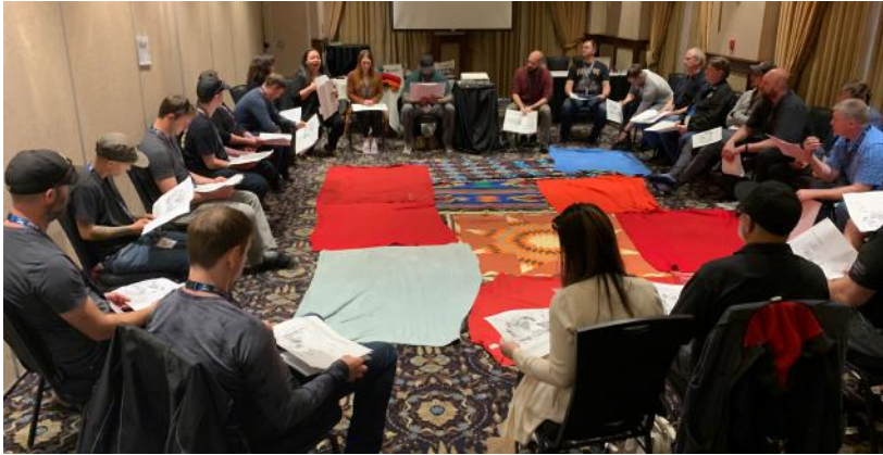
Stewards participating in a Blanket Exercise facilitated by Kairos Canada